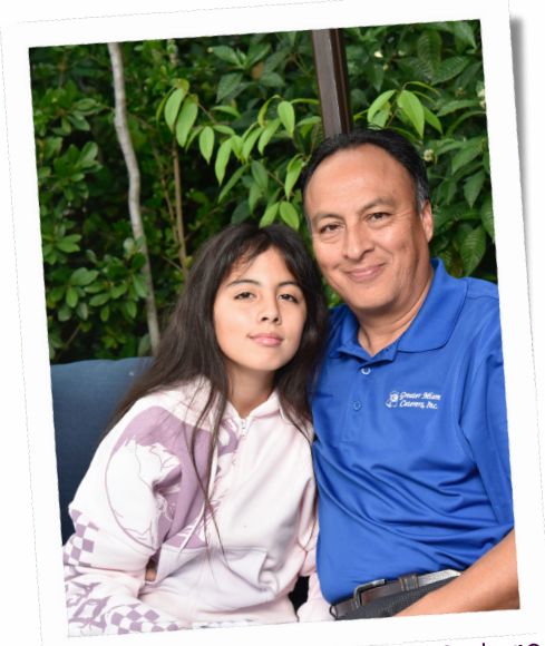
Guests from Greater Miami Caterers enjoyed the event.