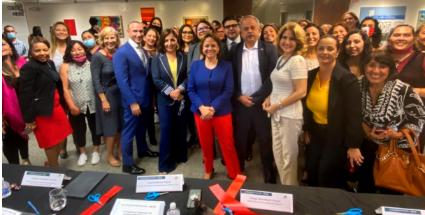
Conversatorio del Programa Consular de Emprendimiento para Mexicanas en el Exterior