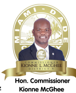
Hon. Commissioner Kionne McGhee