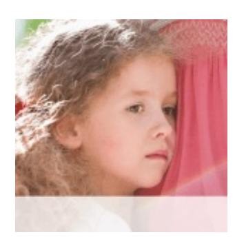
<u>How Can We Help Kids With Self-Regulation?</u>