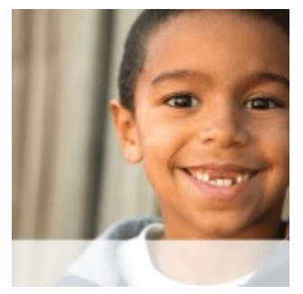
How to Build Boys' Self-Confidence

Getting Family Members on Board With Treatment