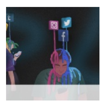
How Using Social Media Affects Teenagers