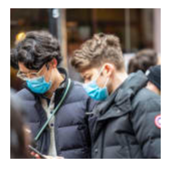
Talking to Kids About the Coronavirus