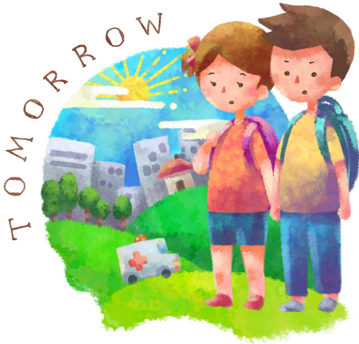
A children's book about COVID-19