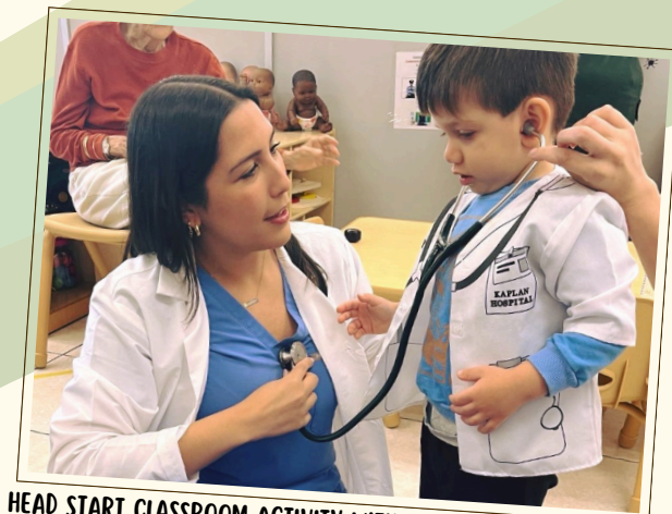
HEAD START CLASSROOM ACTIVITY WITH COMMUNITY VOLUNTEER

Today, she has already achieved her CPR/First Aid certification and is actively working toward completing her Phlebotomy certification. Her journey reflects the power of determination, guidance, and community support in transforming aspirations into reality.